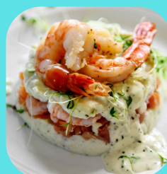
SHRIMP & CRAB CAULIFLOWER RICE STACK