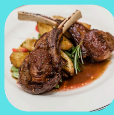
PAN SEARED LAMB CHOP