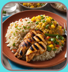
GRILLED MANGO CHICKEN