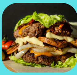
LETTUCE WRAP SIRLOIN BURGER