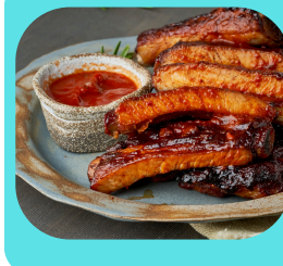
KANSAS CITY SPARE RIBS