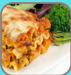
4 CHEESE GROUND BEEF LASAGNA