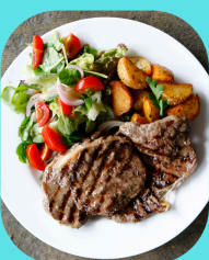
GRILLED RIBEYE & MIXED VEGGIES