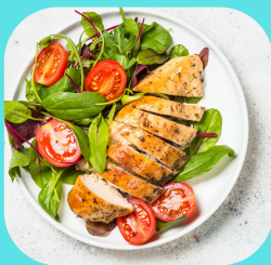
GRILLED LEMON CHICKEN & TRUFFLE VEGETABLES