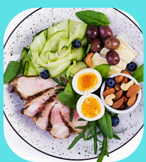
ROASTED PLUM PORK LOIN