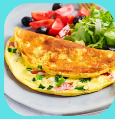
CHEESY SAUSAGE & VEGETABLE OMELETTE