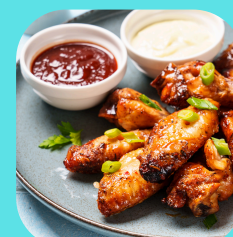
ROASTED BUFFALO WINGS

WEEKLY MENUS EMAILED 7 DAYS IN ADVANCE. DIETARY NEED REQUESTS CAN BE DISCUSSED WITH CHEF DIRECTLY BY PHONE OR EMAIL.