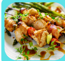
GRILLED CHICKEN & VEGGIE SHISH KABOB