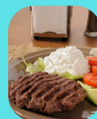
SALISBURY STEAK & MASHED CAULIFLOWER